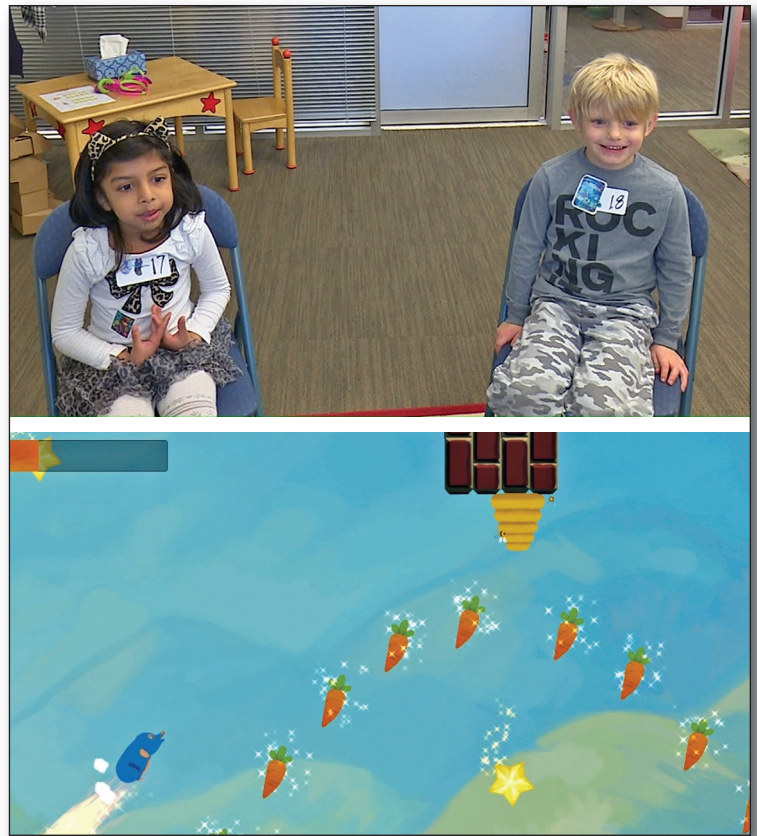
Figure 3. Two Children Playing and a Screenshot from the Animated Side-Scroller Mole .

We created MM in reaction to the problems in RFW. Where RFW has at least two players, MM has exactly two, the minimum number required to produce speech overlap. Where RFW has 20 or more potentially confusable words and phrases that are meaningful in every choice cycle, MM has exactly two phonemically distinct task words, the maximum necessary to provide each player with uniquely recognizable speech. Where RFW's Edith might add her voice to the acoustic confusion, MM's mole takes its turn through silent action. And where RFW has no disincentive for noncharacter-directed conversation, MM is fast-paced, with an obvious visual consequence when task talk is supplanted by side talk. In short, an autonomous RFW entails solving hard versions of hard problems, while an autonomous MM entails solving the same problems in their easiest forms — a degenerate point in the same part of the design space for LBCI.