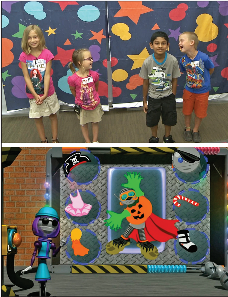
Figure 1. A Small Group Playing and a Screenshot of the Animated Game Robo Fashion World.

(Vannini et al. 2011) as an overarching goal. In contrast, we are interested in language-based character interactions (LBCI) that entertain. Such activities should be novel enough to engage children across the age range, but accessible enough to demand little instruction. They can be brief, but they should be fun. Within these loose criteria, we are free to explore the design space, limited only by imagination, the technologies we can compose or create, and, of course, our ability to predict and channel the language behavior of our young participants. The two case studies presented here might, at first glance, seem to represent very different points in that design space, but they are highly related with respect to the turn-taking problems and challenges they expose.