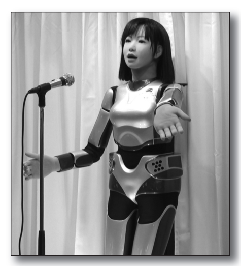
Figure 2. Singing Humanoid Robot HRP-4C by AIST. Demonstrated at CEATEC JAPAN.

benefit from it. In contrast, the technology for the latter should be effective to rather emergent problems that become evident from time to time, such as safe and secure termination of malfunctioning nuclear plants, or identification and removal of radioactive materials from the living environment, to name some. Although there are many challenges for AI technologies, the biggest challenge might be to make their contribution predictive, clear-cut, and accountable, because people have lost their patience with failure even in the long run.