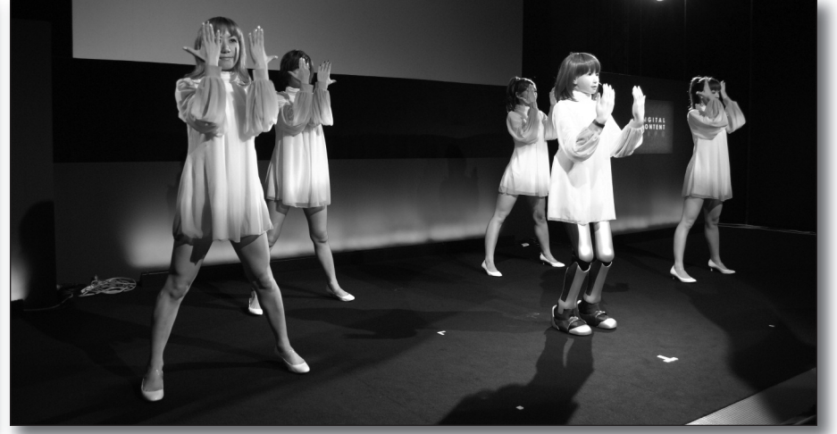
Figure 3. HRP-4C Singing and Dancing with Professional Dancers.

Another great challenge that the Japanese researchers are addressing is strong AI. A practical milestone toward that direction is building an embodied musical intelligence. Masataka Goto, Shuuji Kajita, et al. aim at building a "pop dancer" robot that can autonomously sing and dance. Building a dancing singer robot is quite challenging, for one needs to address not only technical issues such as synthesizing natural singing voices or facial/body movements with humanlike expressions, but also artistic issues such as producing emotional and aesthetic representations to entertain people. Goto and colleagues have already developed some key technologies such as VocaListener (Goto et al. 2010), which generates natural singing voices by imitating human singing. They have also developed a facial expression