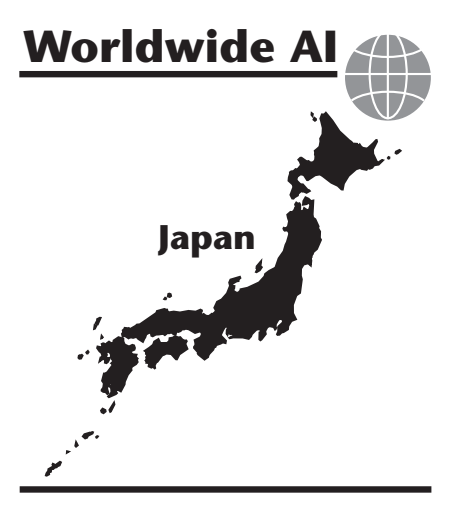
■ This article is the first report in the best of AI in Japan series. This series will focus not only on prominent accomplishments made in AI research and development but also on AI-related events in society. As the first in the forthcoming series, this opening article features a historical background and outlines the contemporary AI research activities in Japan. It then highlights some recent prominent results from industry. Finally, a future perspective is given.