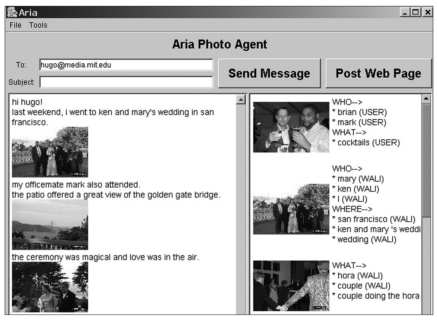
Figure 1. Telling Stories with ARIA.

associative reasoning helps to bridge semantic gaps (such as connect text about "wedding" to a photo annotated with "bride") (Liu and Lieberman 2002). The system also learns from personal assertions from the text (such as "My sister's name is Mary."), presumably unique to the author's context, which can be treated as a source of implicit knowledge in much the same manner as the commonsense assertions coming from Open Mind.