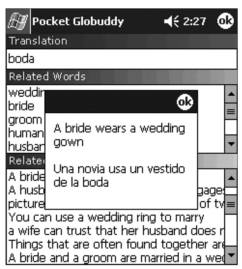
Figure 5. The Globuddy 2 Dynamic Phrasebook Gives Translations of Phrases Conceptually Related to a Seed Word or Phrase.

Reformulator, like Cyc, does inference on the subject matter of the search itself. Our work in improving search engine interfaces (Liu,