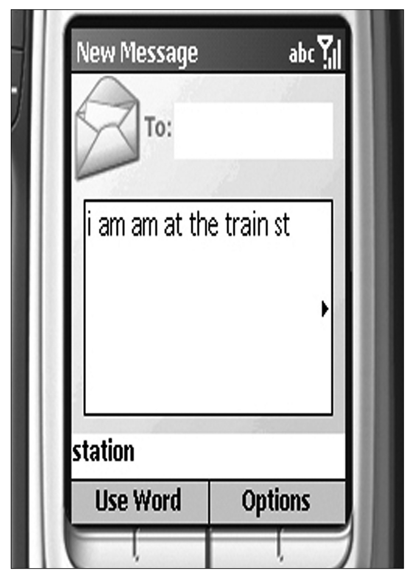
Figure 6. Common Sense Can Lead to Good Suggestions for Word Completion.

that a query may not return the best results, the agent can help to reformulate the query using search expertise and inferencing over commonsense knowledge, and opportunistically suggest "Did you mean to look for veterinarians in Boston, MA?" above the displayed results. In GOOSE, we were able to improve a significant number of queries made by novice users (figure 7). However, in that system, we still needed users to help the system by manually disambiguating the type of search goal. Our current work on automated disambiguation will allow us to develop an interface agent that does not interfere with the user's task at all and suggests a better query (appearing above the search results) only if it is able to offer a bet-