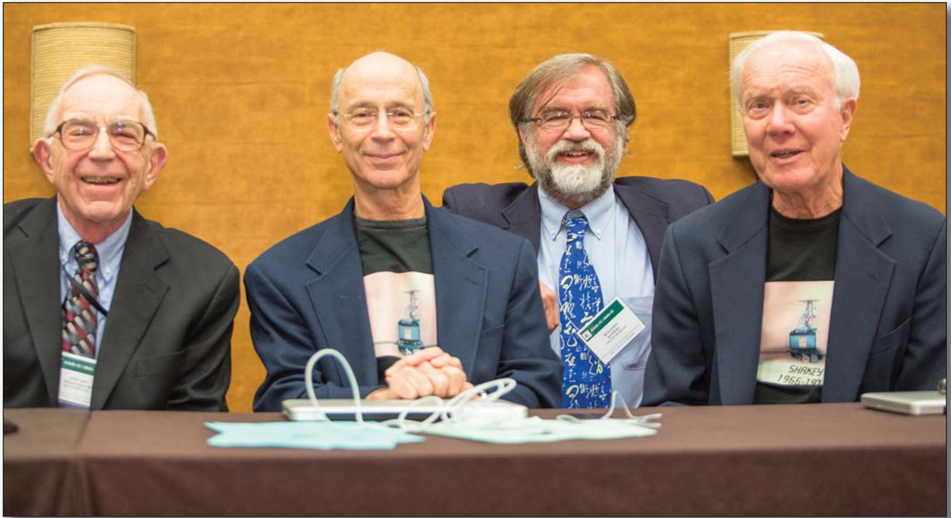
The AAAI-15 Shakey Celebration