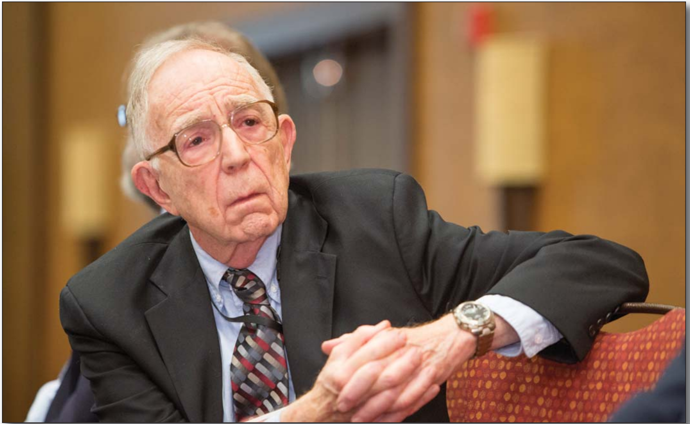
Edward Feigenbaum, Second President of AAAI at AAAI-15.

of optimality in planning solutions), generating additional research problems for the AAAI community.