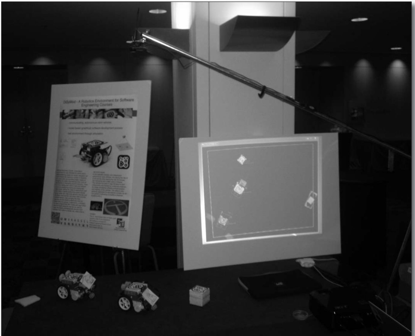
Figure 3. University of Kassel's Exhibit.

In this exhibit of curriculum, students developed software engineering experience by specifying the behaviors of distinct agents. At the exhibition, observers could specify roles for physical agents. In this example, a Lego cat would chase a mouse, which alternately hid away in safety and sneaked out to grab cheese from the table.