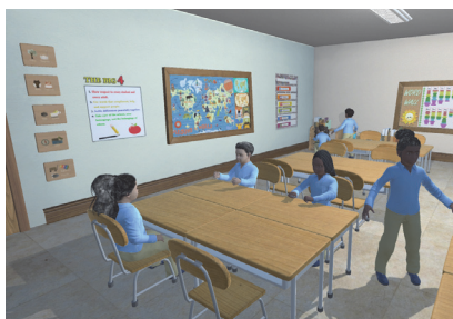
Figure 2: IVT Scene - Drum solo pathway

software. Simplification of these vignettes is very important considering the vignettes' massive initial size; Each vignette contains approximately 50 pathways, and each pathway contains approximately 20 actions/events. The use of MASCARET is, therefore, essential for IVT.