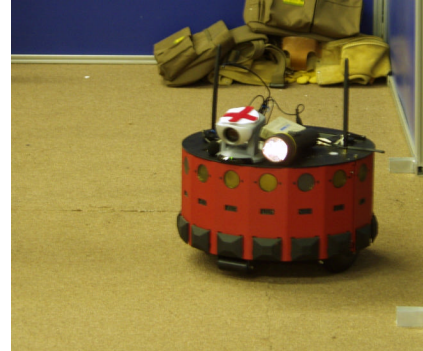
Figure 1: One of the Magellans entering the USR arena.

Since robust autonomous systems are still a difficult research problem, effective user interfaces are critical. Thus, the focus of our 2003 USR entry was to develop an effective, responsive user interface that permitted the operator to use a range of autonomy in navigation, and provide the greatest flexibility in the use of the robot's hardware. As a result of the effective interface and the robot's limited