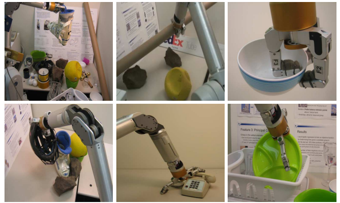
Figure 3: Snapshots of our robot grasping novel objects of various sizes/shapes.

Local Planarity / Force-Closure: One needs to ensure a few properties to avoid slippage, such as a force closure on the object (e.g., to pick up a long tube, a grasp that lines up the fingers along the major axis of the tube would likely fail). Further, a grasp in which the finger direction (i.e., direction in which the finger closes) is perpendicular to the local tangent plane is more desirable, because it is more likely to lie within the friction cone, and hence is less likely to slip. For