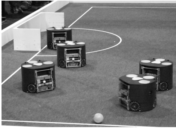
Figure 1: In the Small Size League, two teams with five robots per team compete in a soccer match. The robots use rotating rubber bars to grip a golf ball for “dribbling” and can kick the ball at velocities of up to 10 m/s to pass or shoot on goal. The robots are controlled wirelessly by an off-board computer that tracks all ten robots and the balls using overhead cameras mounted above the field.

mation from overhead cameras. The robots are 18 cm in diameter and the field is approximately 5 m by 3 m in size. Due to the scale of the robots, a golf ball is used as a soccer ball. The robots move at up to 2.5 m/s and can kick the ball at velocities of up to 10 m/s, which results in fast-paced games. The role of goalie on each team is fixed, but the remaining four robots take on a variety of offensive and defensive roles as the game evolves. These roles are what we recognize during classification.