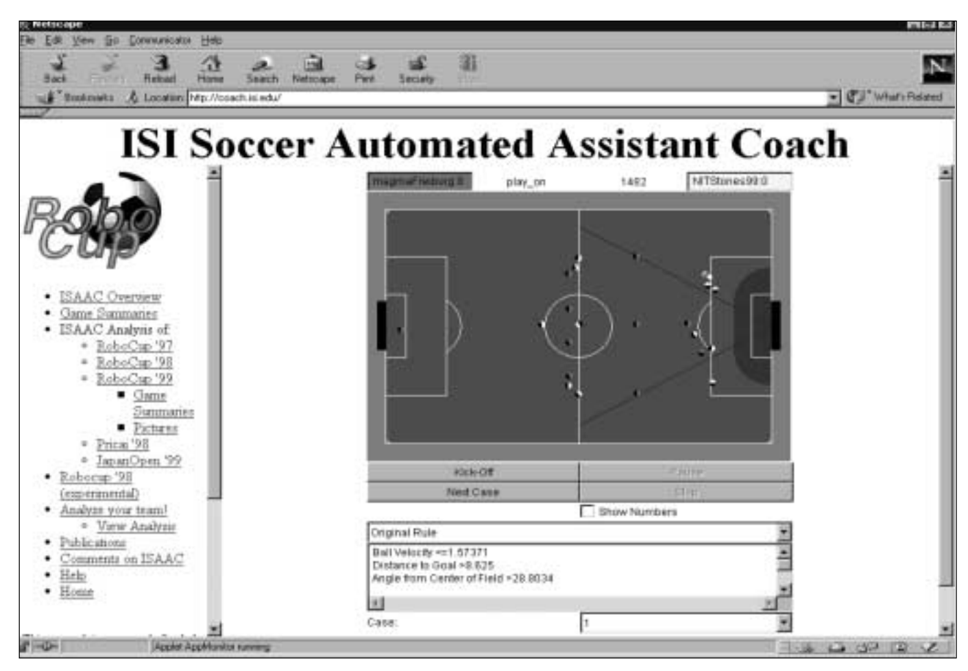
Figure 2. ISAAC'S Multimedia Viewer.

extension to C4.5, to create rules of success or failure (Quinlan 1994). For analysis of agent interactions ( multiple agent key interaction model ), predefined patterns are matched to find prevalent patterns of success. To develop rules of team successes or failures ( global team model ), game-level statistics are mined from all available previous games, and again, inductive learning is used to learn rules that determine game success and failure.