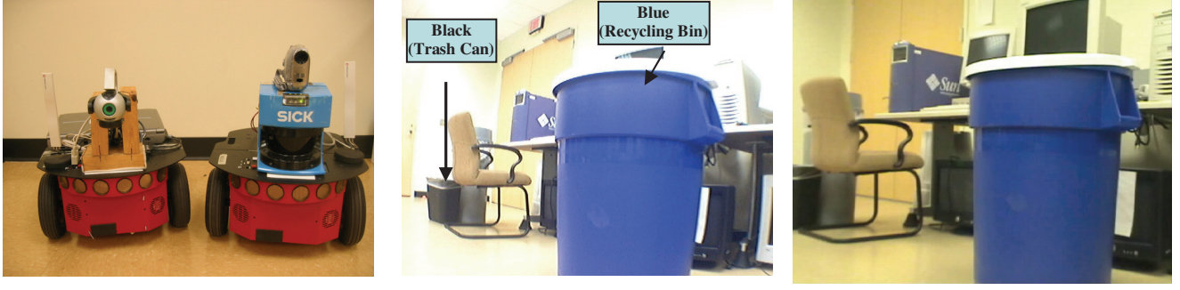
Figure 1 – Pioneer 2DX robots used in the experiments (left) and images of the same scene from each robot (middle and right). The middle image is from the robot with the web camera, while the image on the right is from the robot with the camcorder.

In our case, we seek to map individual clusters to each other, not determine overall similarity between clusterings of the entire space. Hence, instead of calculating such metrics we utilize the confusion matrix to determine pairs of properties that may potentially represent the same physical property. Suppose that there are two clusterings G_i^A and G_j^B defining regions corresponding to properties p_i^A and p_j^B for robot A and B, respectively. Also, each clustering for robot A and B has n_i^A and n_j^B clusters, respectively. Finally, suppose that we have a set of instances I from each robot (obtained using its own sensing) with a sufficiently high membership defined by a threshold for property p_i^A . The confusion matrix PC^{A,B} is then updated with: