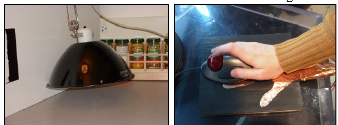
Figure 2. Thermal interruption generator

In order to demonstrate the benefits of using other